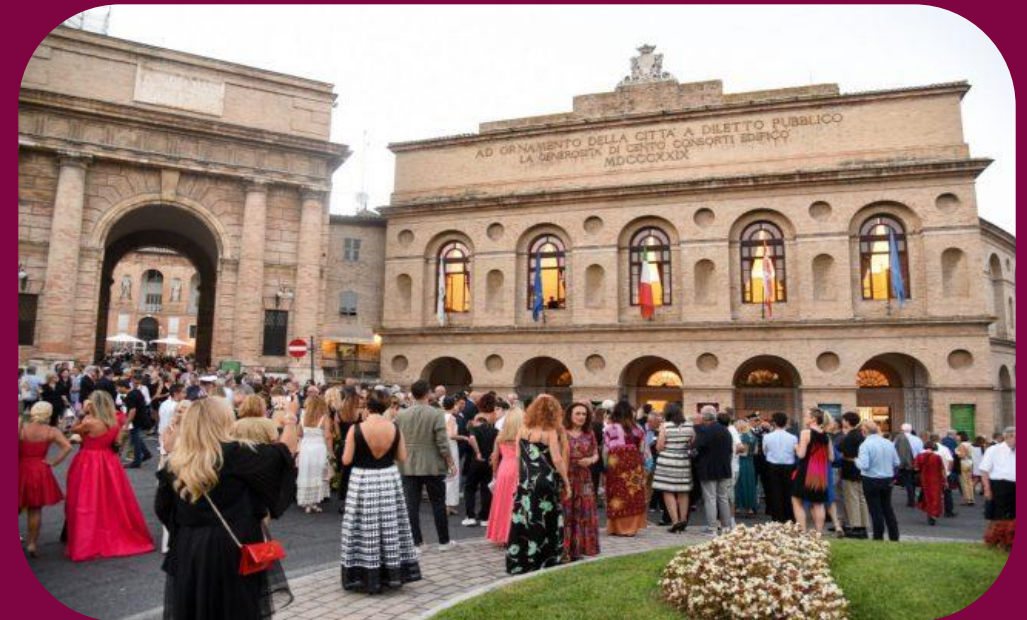
Sferisterio di Macerata Macerata Opera Festival (July-August)