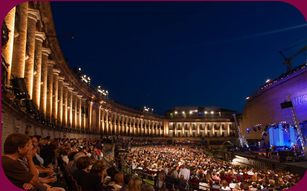
Sferisterio di Macerata Musicultura (late June)